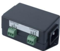
PowerEgg 600 237