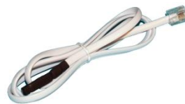
Temp-1Wire 1m 600 242