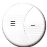
Smoke detector 600 310