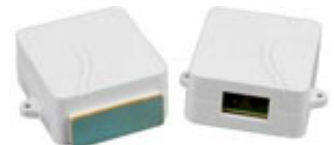
HTemp-1Wire Box2 600 344