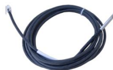
Temp-1Wire-Outdoor 3m 600 311