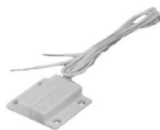
Door Contact 600 119