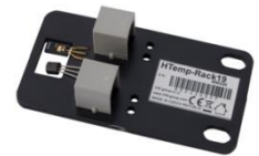
HTemp-Rack19 600 330