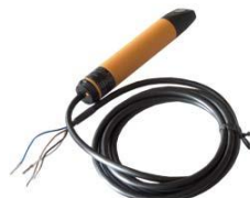
AirFlow detector 5101 600 304