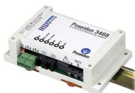
Poseidon 3468 600 349