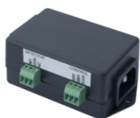
PowerEgg 600 237