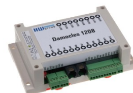
Damocles 1208 600 411