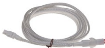
WLD sensing cable A - 2+2m 600 417